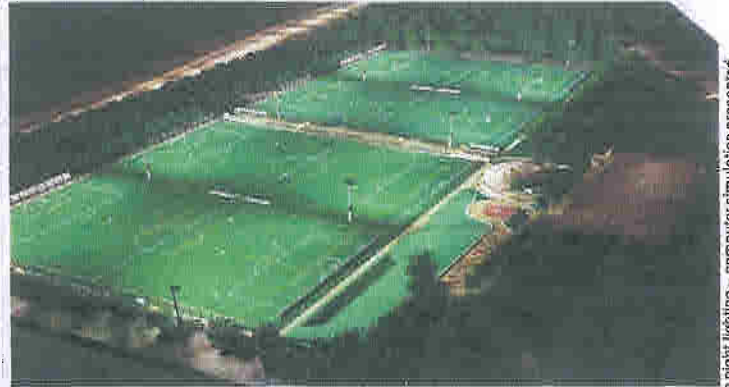
Project with night lighting - computer simulation presented at public meetings by the City Fields Foundation

The proposed soccer complex will take up more land and includes a championship field. Night lighting will be on from sunset until 10:00 p.m. all year. The field will be artificial turf. According to RPD planning documents, this project will eventually contain six fields, not the four fields shown in the simulation.