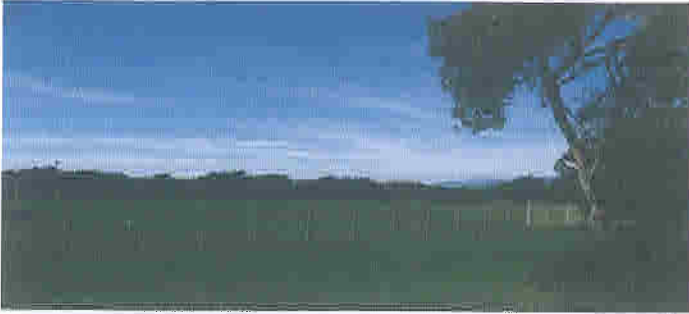
The current practice soccer fields are in a grassy meadow surrounded by groves of trees.

The Recreation and Park Department is planning to build a soccer complex in the western end of Golden Gate Park behind the Beach Chalet, replacing the current grassy practice meadow with larger artificial turf fields and adding intensive 60 ft. tall sportsfield lighting. Eventually, two more fields will be added, enlarging the complex to an area one-half the width of Golden Gate Park and larger than Candlestick Stadium. This project will change the western edge of the Park from parkland to a highly developed urbanized space. Yet, very little outreach has gone out to San Franciscans about this change to the character of Golden Gate Park and Ocean Beach.