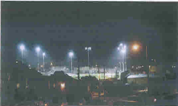
South Sunset Playing Field - sportsfield lighting seen from four blocks away. What will be the experience at Ocean Beach, with this type of lighting nearby?

The proposed soccer complex will take up more land and includes a championship field. Night lighting will be on from sunset until 10:00 p.m. all year. The field will be artificial turf. According to RPD planning documents, this project will eventually contain six fields, not the four fields shown in the simulation.